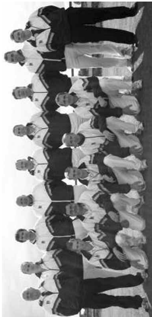
BRITISH SUGAR Winners of the 20:20 Knock Out Competition 2007