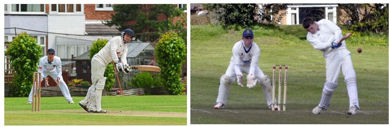
Sentinel 1<sup>st</sup> XI vs Ludlow 1<sup>st</sup> XI 2016 (Premier)

Please search for @ShropCCLeague or search Shropshire County Cricket League in the Twitter Search Bar.