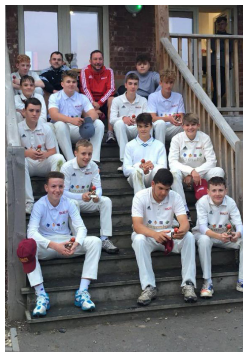
Knockin & Kinnerley CC celebrate a successful Junior Finals Day with their Under 11s (left) and Under 15s (centre) and Under U15 finalists Beacon (right)

There was a great day of competition as the finalists came together to battle it out at the Henshalls Shropshire County Crickety League's Junior Finals Day.