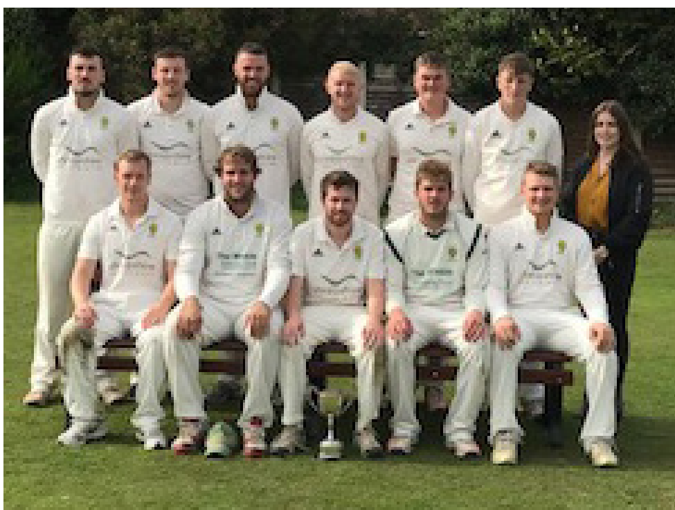
Premier Division Champions Wem pose with the trophy after their final day victory.

There was an exciting finish on the final day of the Henshalls Sunday Division One campaign with any one of four sides in with a chance of claiming the trophy.