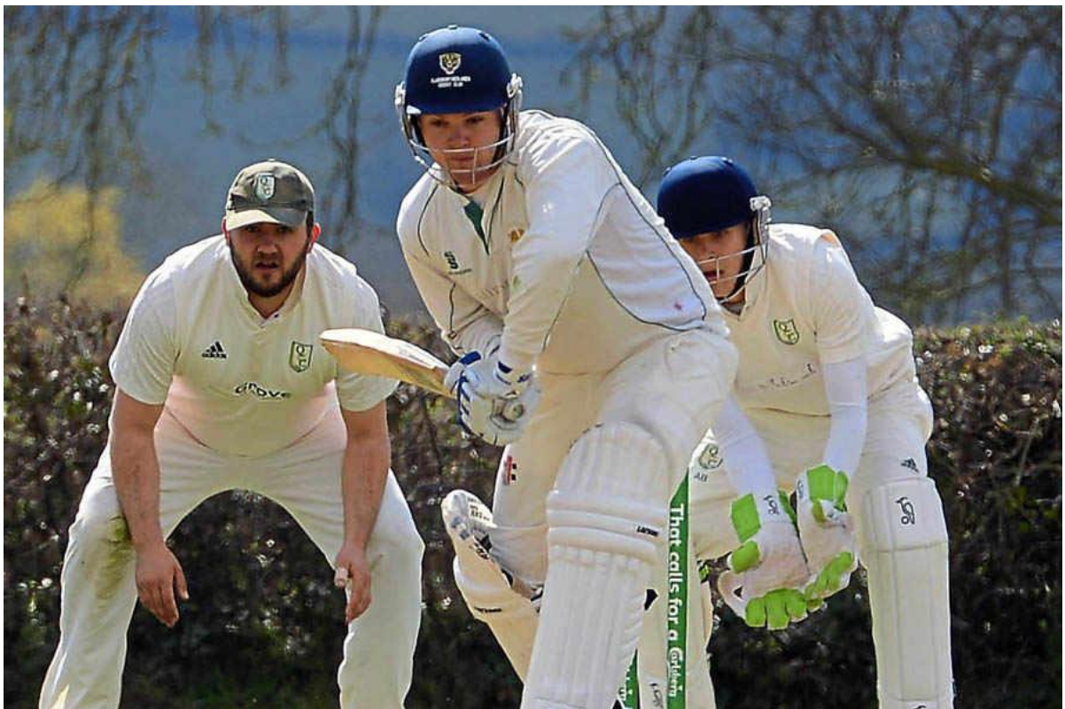
Quatt 1 st XI vs Shelton 1 st XI 2016 (Premier)