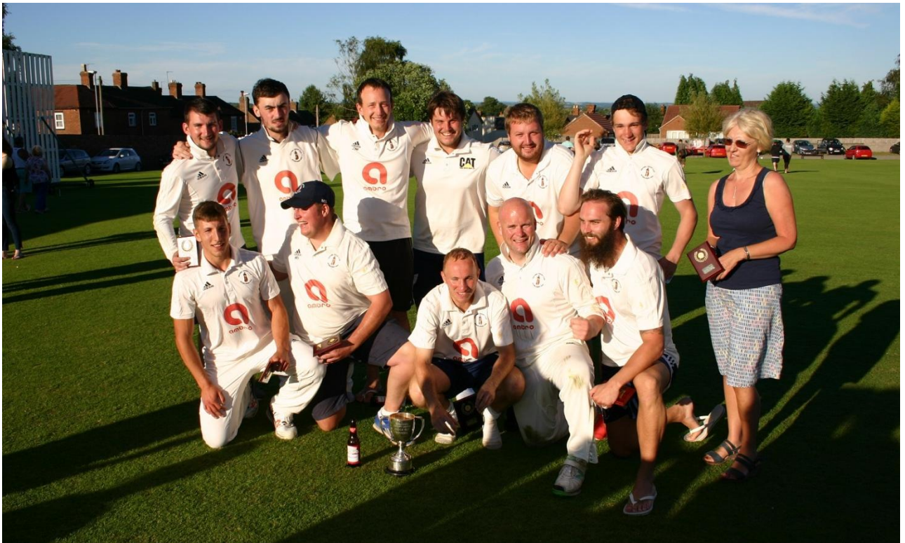
2016 SCCL Lynx Senior Slam T20 Champions – Sentinel CC