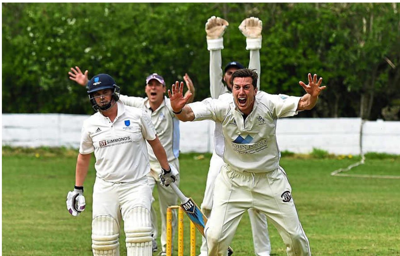
Albrighton 1 st XI vs Broseley 1 st XI 2016 (Premier)

We hope you enjoy reading the newsletters and embrace the new website and social media outlets that have been developed, see http://www.shropshirecricketleague.co.uk/ for more information.