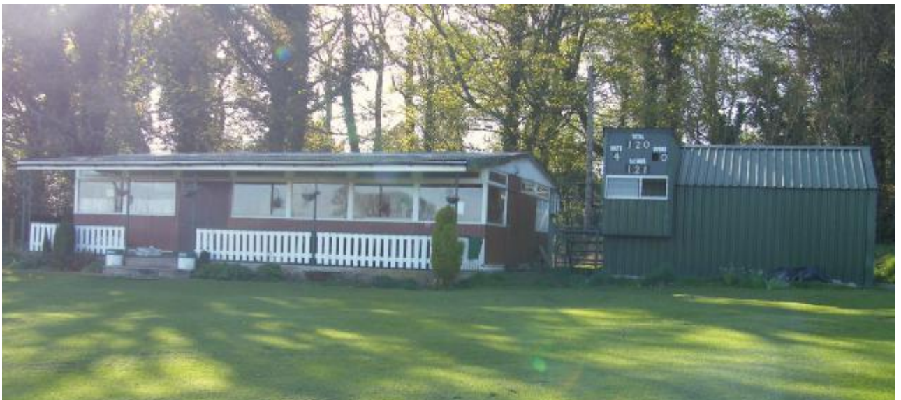
Willey CC – Home of the 2016 SCCL Lynx Junior Slam T20 Winners