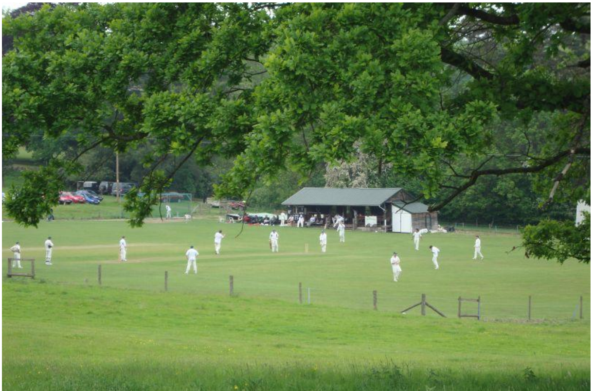
Scenic Shot of Millichope Park – Home of Corvedale Cricket Club ( 1 st XI Division 3 and 2 nd XI Reserve Division 3)