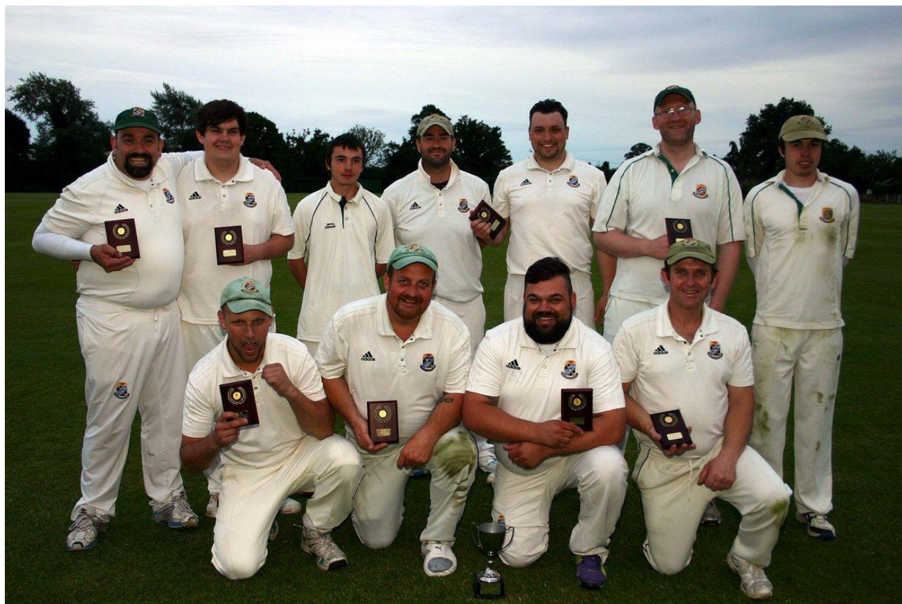
Willey CC – 2016 SCCL Lynx Junior Slam T20 Champions