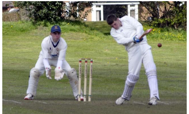
Church Stretton vs Shrewsbury 3 rd XI 2016 (Div 2)