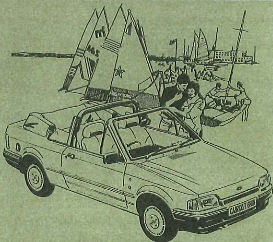
Escort Cabriolet Ghia

TEST DRIVE THE 1987 FORDS NOW YOU CAN'T DO BETTER