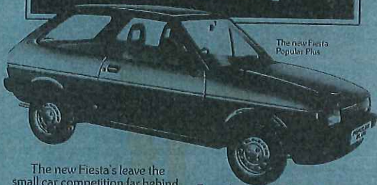
The new Fiesta Popular Plus

The new Fiesta Popular Plus. Space, style, comfort and economy.