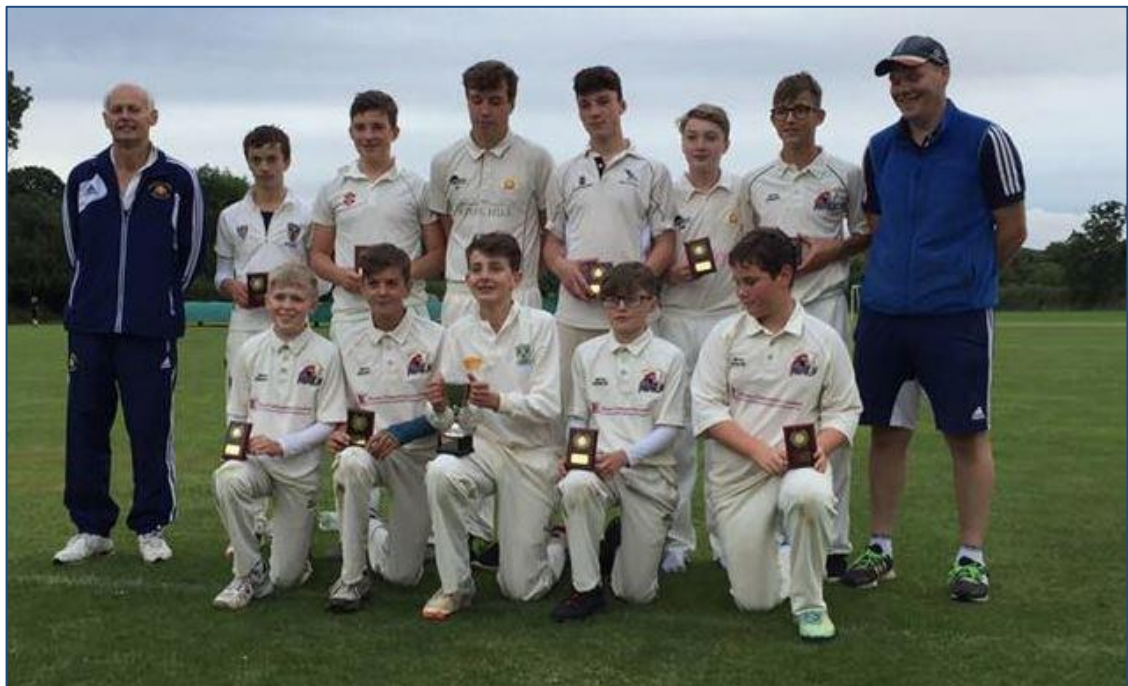
Knockin and Kinnerley U15 – SCCL U15 Junior League Champions 2016

Also, the League encourages all clubs to register an interest in the U9 softball festivals being planned for this summer – see the Cricket Shropshire website for more details www.shropshirecricketboard.co.uk