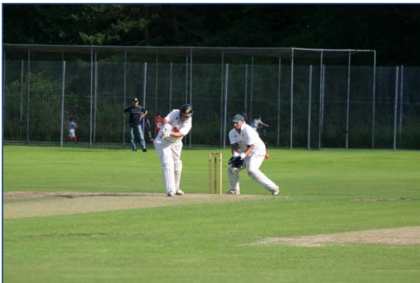
Sentinel T20 XI vs Wem T20 XI – SCCL Senior Slam Final 2016

A copy of the Declaration, duly signed and dated, must be displayed prominently in the club pavilion or clubhouse for all club members, both playing and non-playing, to see.