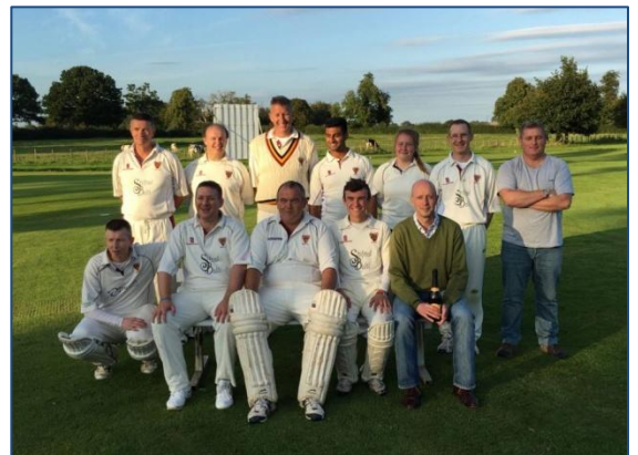
Shifnal 3 rd XI – SCCL Division 3 Champions 2016