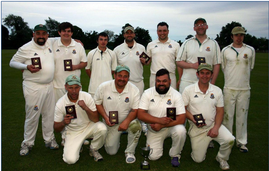
Willey CC T20 XI – SCCL Junior Slam Champions 2016