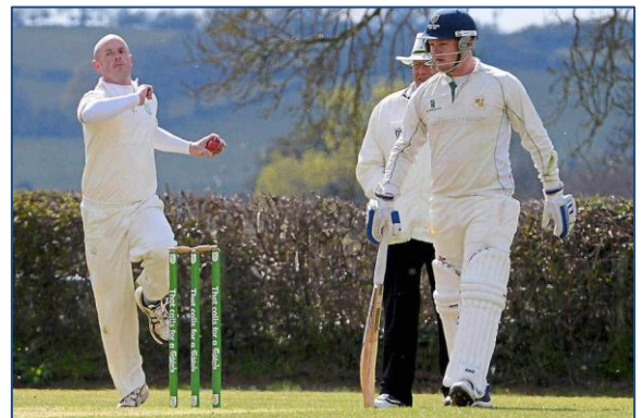
Quatt 1 st XI vs Shelton 1 st XI 2016 (Premier)