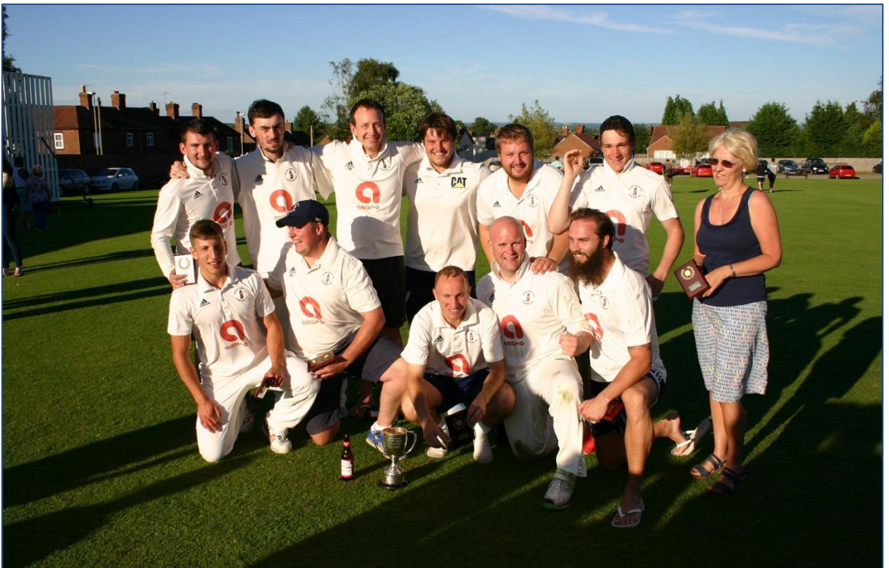
Sentinel CC 1 st XI – Henshalls SCCL Premier Division Champions and Lynx Senior Slam T20 Champions 2016

With the 2017 Shropshire County Cricket Season fast approaching, welcome to the League's pre-season newsletter keeping clubs advised of current and new initiatives that will affect and benefit your club. Please circulate to all your players and members, and don't hesitate to give us any feedback on areas we can improve or items you think we should carry – it's your League after all! As ever, the newsletter is also available to view on the League's website www.shropshirecricketleague.co.uk