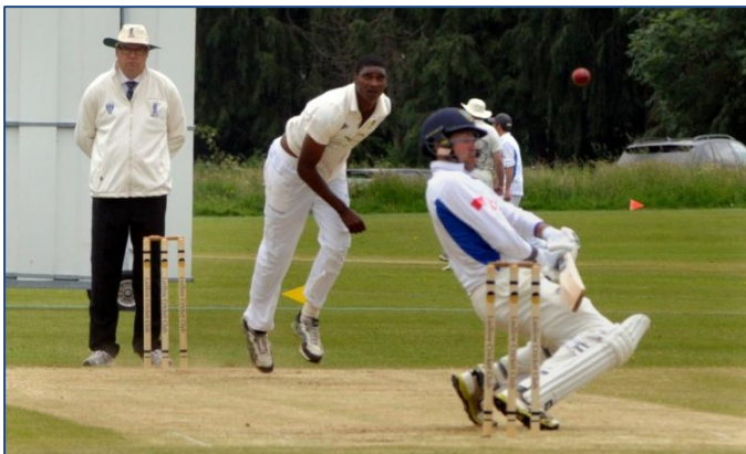
Ludlow 1 st XI vs Wem 1 st XI 2016 (Premier)

We hope you enjoy reading the newsletters and embrace the new website and social media outlets that have been developed.