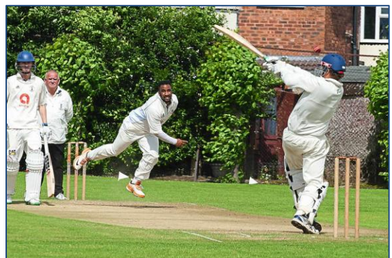
Sentinel 1 st XI vs St Georges 1 st XI 2016 (Premier)