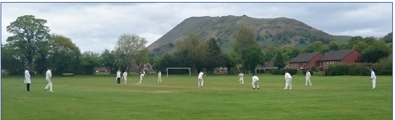
Church Stretton CC in action (Div 2)