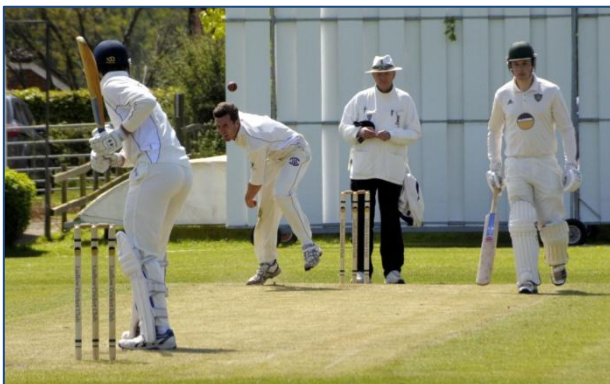
Ludlow 1 st XI vs Albrighton 1 st XI 2016 (Premier)