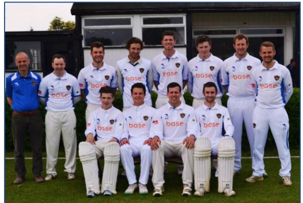
Ludlow Cricket Club 1 st XI 2016 (Premier)