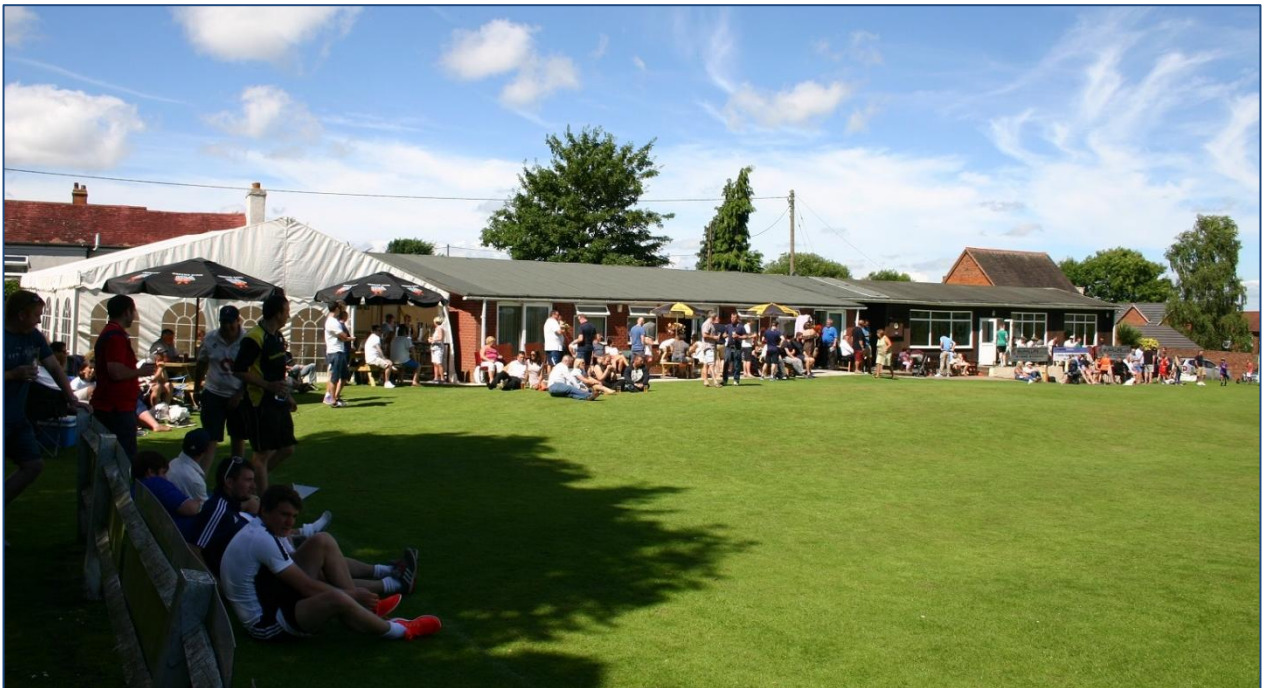
SCCL Senior Slam Finals Day 2016 at Madeley CC

This is an important briefing session for the new season, where balls, our new yearbook, result sheets and other relevant paperwork will be issued, so please ensure that your team captains and representatives attend.