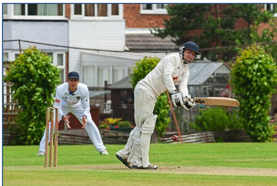
Sentinel 1 st XI vs Ludlow 1 st XI 2016 (Premier)

The accreditation period runs from April to the end of October and individual clubs will be contacted by the SCB office to arrange site visits and support sessions.