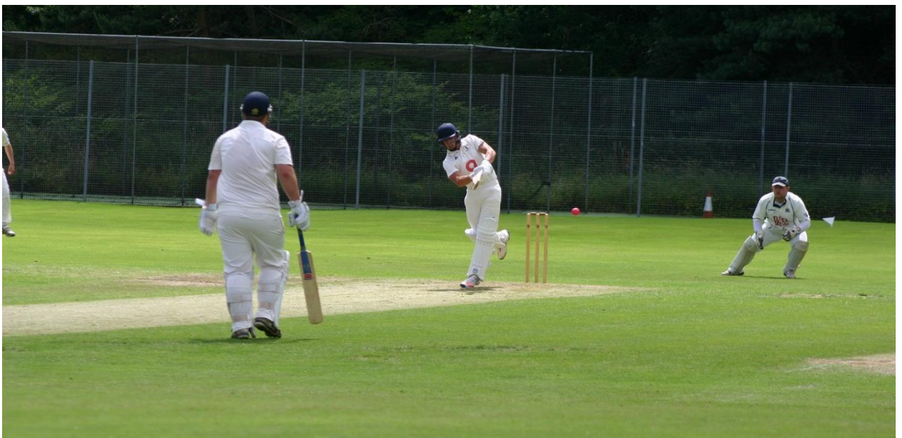
Sentinel T20 XI vs Wem T20 XI – SCCL Senior Slam Final 2016

There are a number of changes to the SCCL rules for the 2017 season and these are included in the attached Rule Changes document. All major rule changes will also be discussed at the Captains Meeting on Monday 24th April.